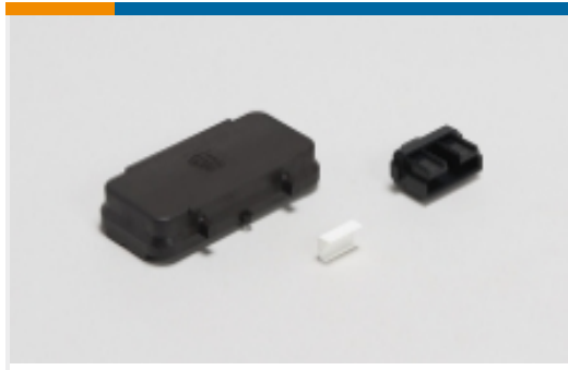
Rectangular Caps & Covers(4)